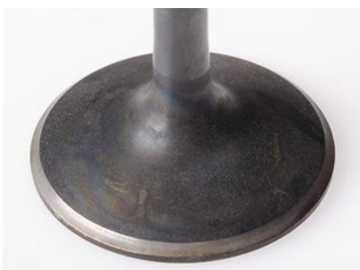
... with MAINTAIN GASOLINE PLUS