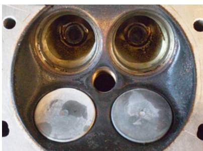
... with MAINTAIN GASOLINE PLUS